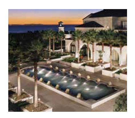
Hyatt Regency Huntington Beach Resort and Spa, Huntington Beach, Calif.